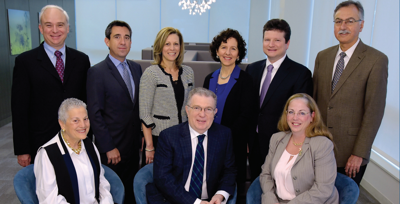
Cancer Program Executive Council