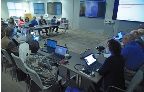
Interdisciplinary Tumor Board Meeting

In addition, the Hospital offers comprehensive counseling to support every aspect of physical and emotional well-being.