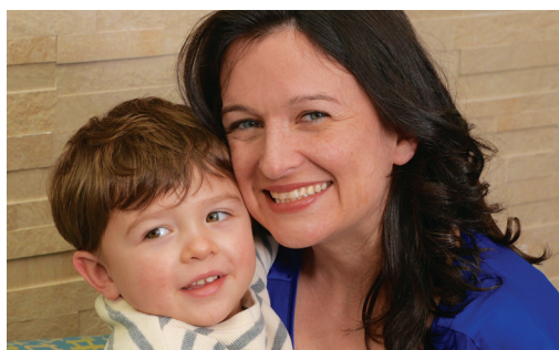
Top: Cancer survivor with her son, with whom she was pregnant during her cancer diagnosis and treatment.